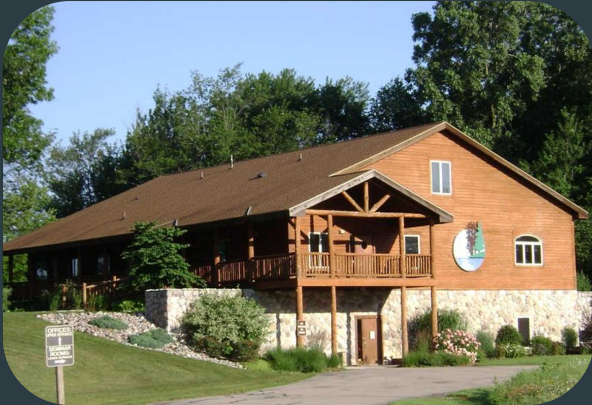
Bengal Wildlife Center: Home of the Conservancy